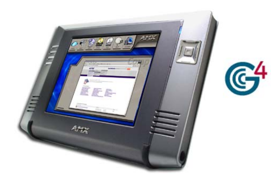
FIG. 1 MVP-7500 Wireless Touch Panel (FG5965-01)

For more detailed installation, configuration, programming, file transfer, and operating instructions refer to the MVP-7500 and MVP-8400 Modero ViewPoint Touch Panels Instruction Manual, available on-line at www.amx.com .